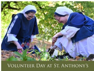
Come join us! Mass and lunch included

You may remember, the Sisters of Life came for a visit this fall and spoke to us at mass about their vocation and love of faith. They are always looking for volunteers to help them with several projects at their priory, located at 24 Harrison St, Catskill, NY 12414