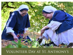
Come join us! Mass and lunch included

You may remember, the Sisters of Life came for a visit this fall and spoke to us at mass about their vocation and love of faith. They are always looking for volunteers to help them with several projects at their priory, located at 24 Harrison St, Catskill, NY 12414