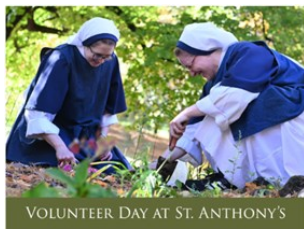
Come join us! Mass and lunch included

You may remember, the Sisters of Life came for a visit this fall and spoke to us at mass about their vocation and love of faith. They are always looking for volunteers to help them with several projects at their priory, located at 24 Harrison St, Catskill, NY 12414